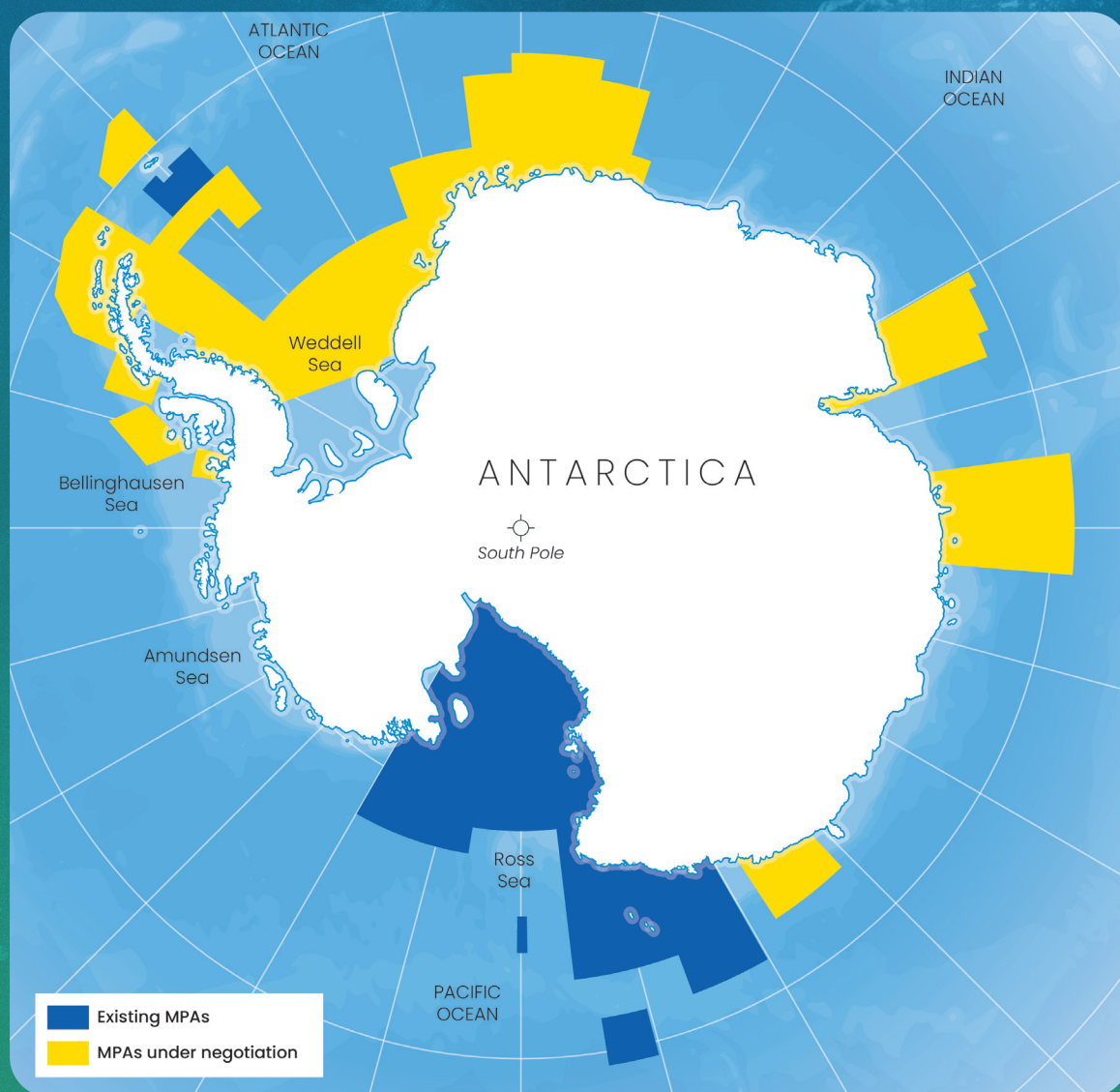
Figure 3. Antarctica MPAs (Adapted from Antarctic and Southern Ocean Coalition). MPAs designated and under negotiation in the Southern Ocean illustrate ongoing efforts to strengthen area-based conservation in Antarctic waters. The Weddell Sea MPA proposal highlights both the ecological importance of large-scale protection and the governance challenges of implementing conservation measures in dynamic and internationally managed ecosystems.

Taken together, these challenges illustrate the difficulty of reconciling conservation objectives, economic interests and scientific uncertainty in rapidly changing ecosystems.