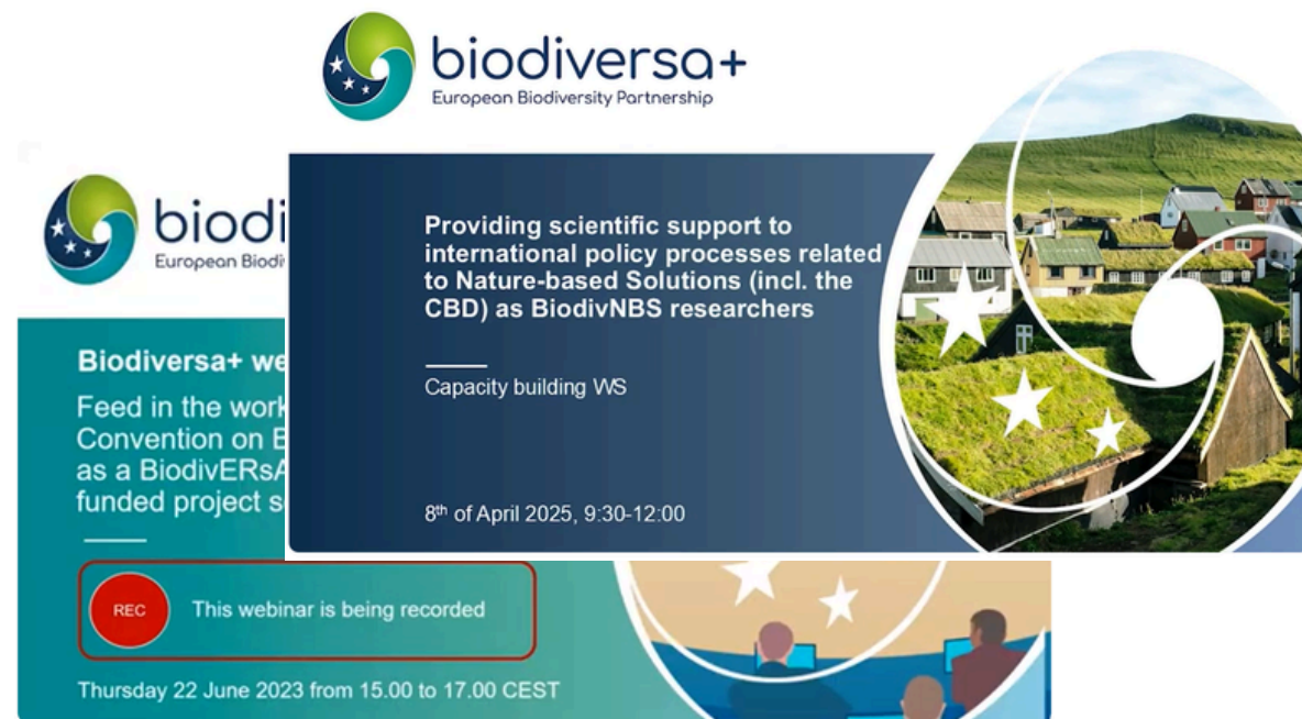
Biodiversa+ CBD capacity-building events