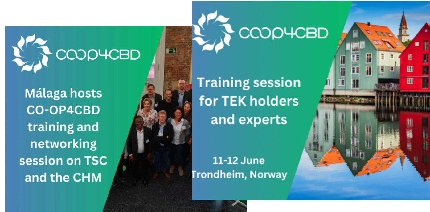
CO-OP4CBD training sessions